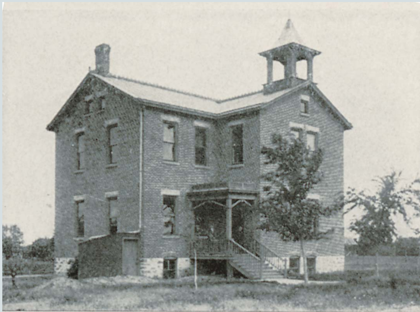
Village of Middleton High School built in 1903 for approximately $5,000 at the corner of Franklin Street and Middleton Street in the current City of Middleton.

The Town of Middleton was organized on March 11, 1848. It was named by Harry Barnes after a settlement bearing the same name in the state of Vermont. The total area was six miles square. The approximate boundaries of the town ran from Schneider Road on the North to Midtown Road on the South and from Lake Mendota on the East to Cleveland Road (now Timber Lane) on the West. The original area included what is now the City of Middleton and portions of Madison. Eight years later, in 1856, the Village of Middleton was formed (currently the City of Middleton).