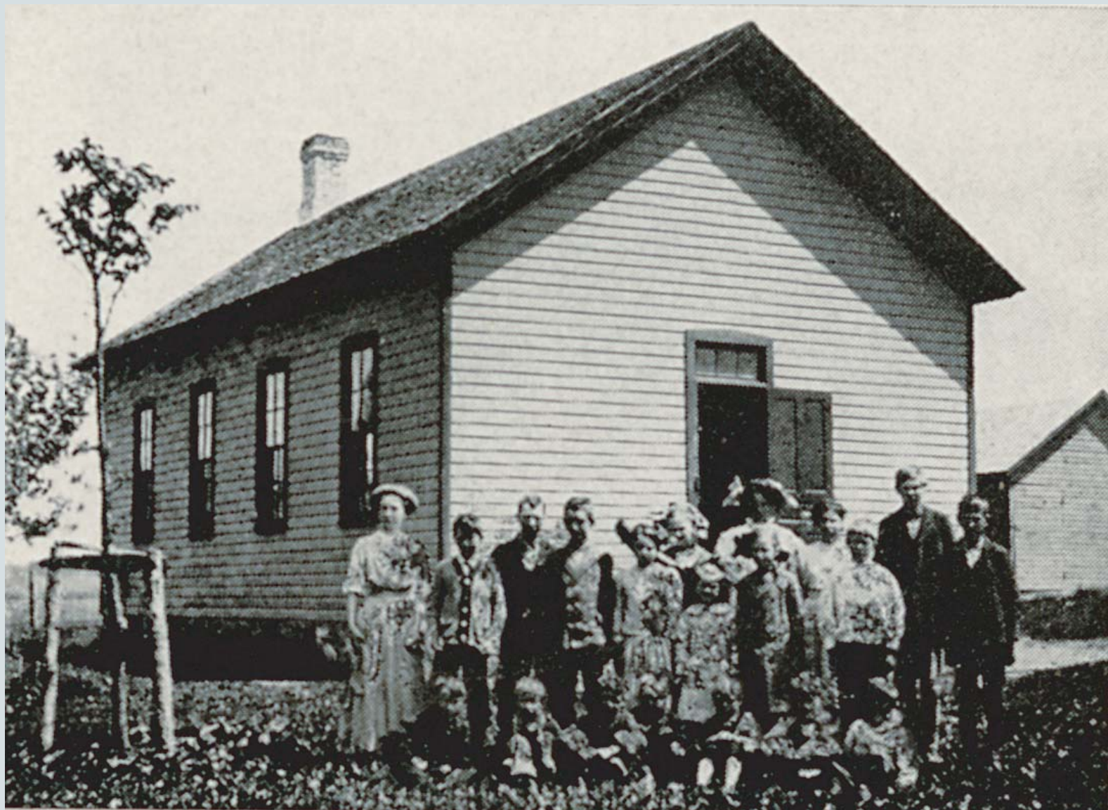
The history of West Middleton School dates back to 1849 It was originally called the Yellow School and was located on Pioneer Road, ½ mile south of Mineral Point Road. The original school was built for $225.